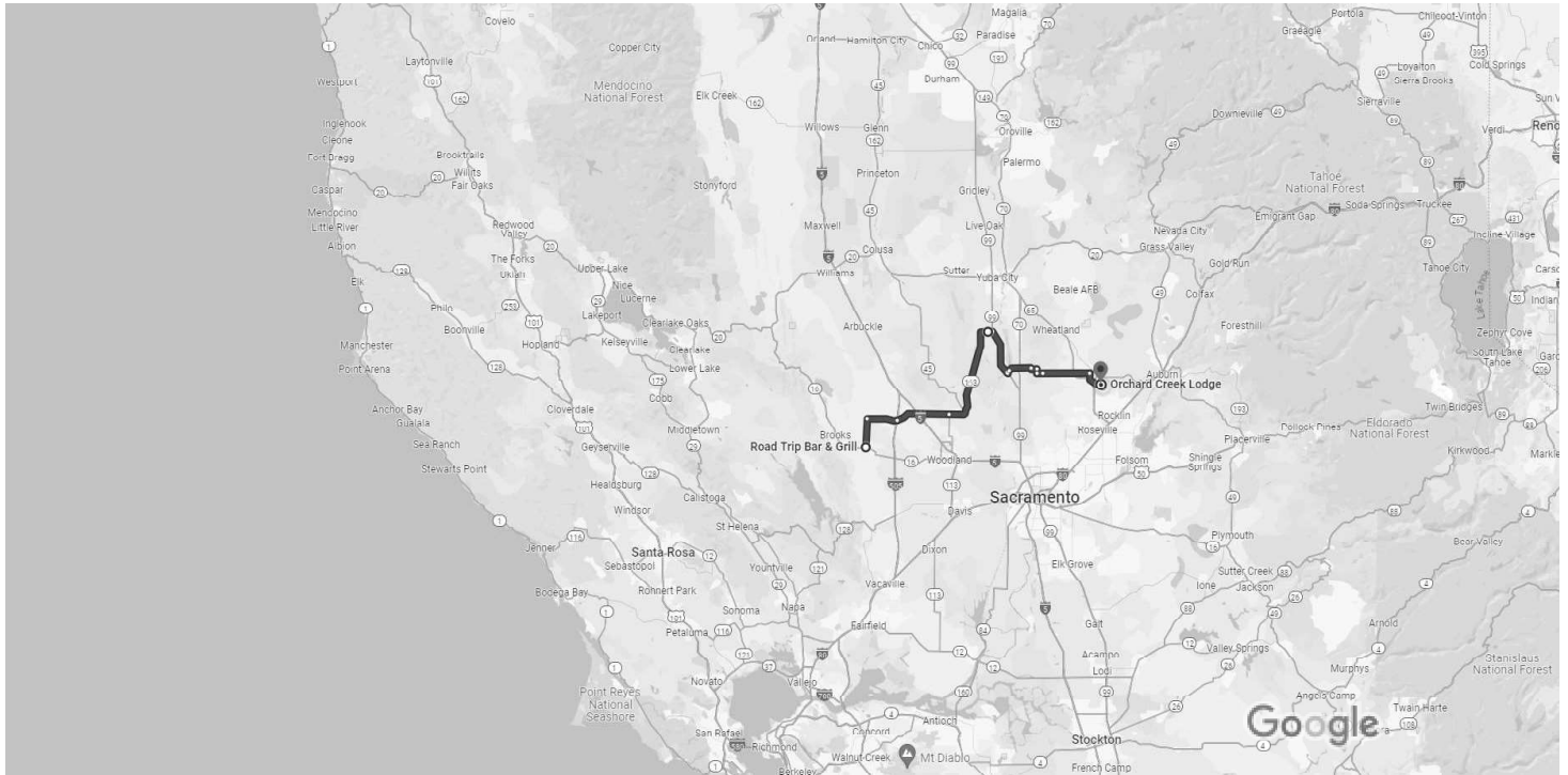
Map data ©2024 Google 10 mi