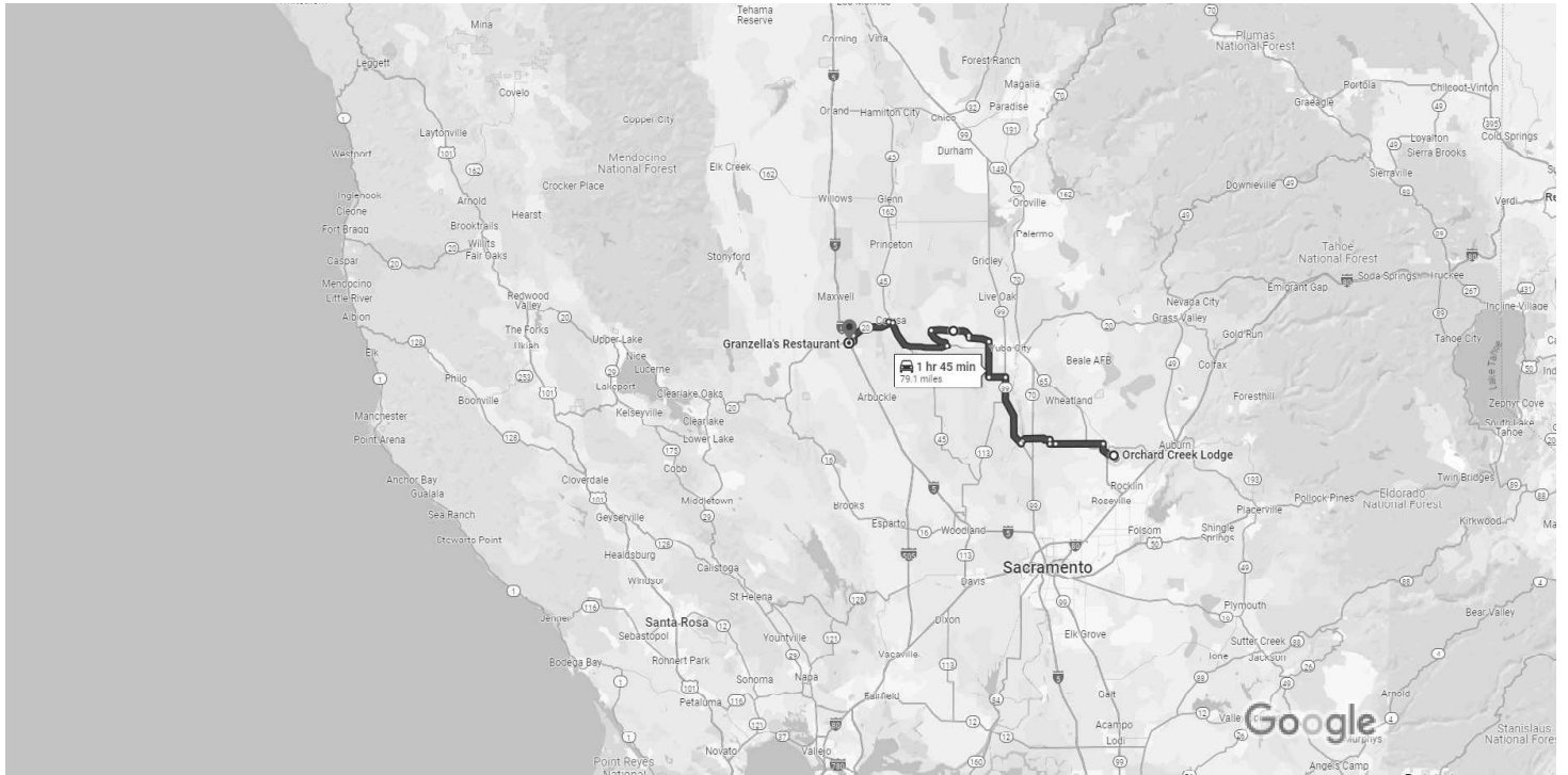
10 mi

Orchard Creek Lodge 965 Orchard Creek Ln, Lincoln, CA 95648